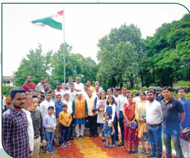
Celebration of 76th Independence day at IILM, Ranchi