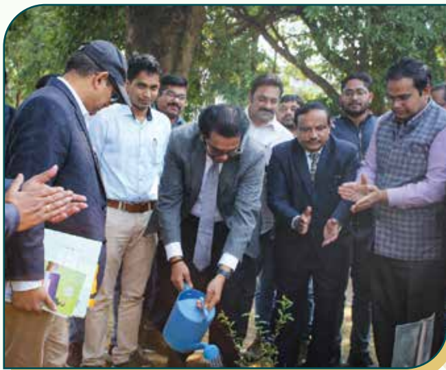
Plantation by Respected Secretary, Department of Consumer Affairs at IILM, Ranchi

Note: The detailed syllabus of each course is uploaded on the website of the Institute ( www.iilm.gov.in )